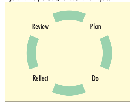
Figure 1. The plan, do, reflect, review cycle.

Assessing learning needs in teaching situations should then be a shared endeavour. Teachers play a key role in helping learners develop critical self-reflection and independence by providing opportunities for self-assessment of their clinical competence, knowledge, understanding and attitudes and by pointing out where there is a mismatch between self perception and observed behaviours. Building in simple questions such as 'how do you think that went....' opens up opportunities for learners to routinely reflect on and review their performance.